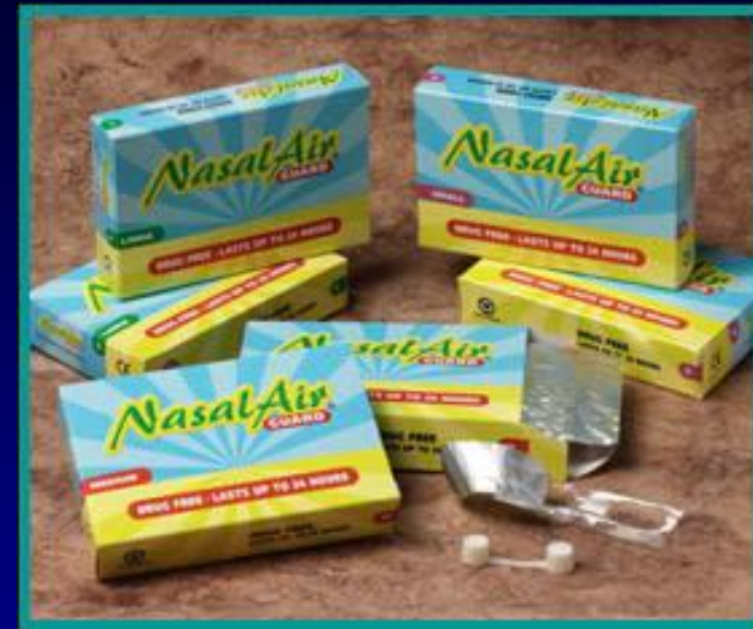
Nasal Air Guards